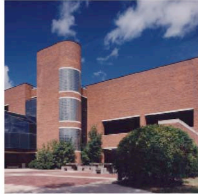
Student Service/ Learning Resource Center Terra Community College Fremont, OH