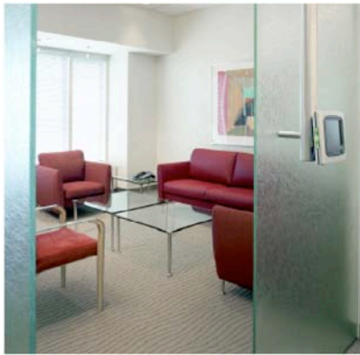
McKinsey & Company, Inc. Cleveland, OH IIDA Regional Design Awards IIDA + IESNA Regional Design Awards NAIOP Regional Design Award