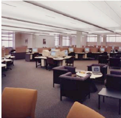
Technology Learning Center Cuyahoga Community College Cleveland, OH American School & University Design Award