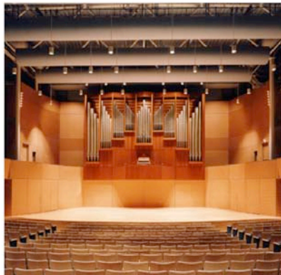
Wategen Hall Renovations; Cleveland State University Cleveland, OH