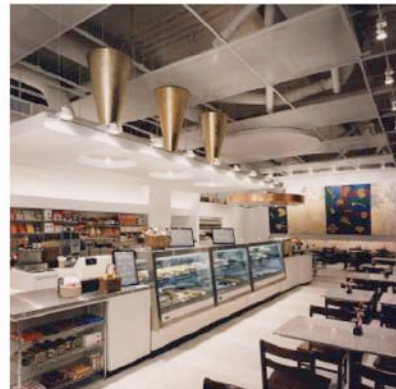
Cafe Paradiso Cleveland, OH IDB/ IIDA National Design Competition Winner AIA Ohio Design Award AIA Cleveland Design Award IIDA Cleveland Design Award NAIOP Regional Design Award