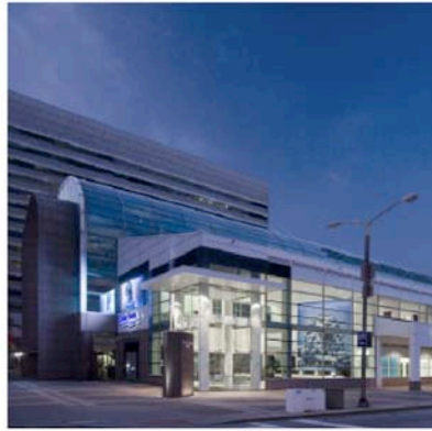
Dollar Bank/ Renovation of the Galleria at Erieview Cleveland, OH First Place, Retail Renovation, VM+SD National Design Competition City of Cleveland Redevelopment Project of the Year IIDA Cleveland Design Award