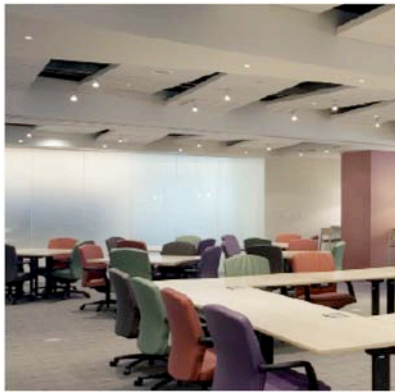
McKinsey & Company, Inc. Cleveland, OH IIDA Regional Design Awards IIDA + IESNA Regional Design Awards NAIOP Regional Design Award