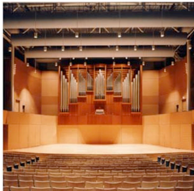
Wategen Hall Renovations; Cleveland State University Cleveland, OH