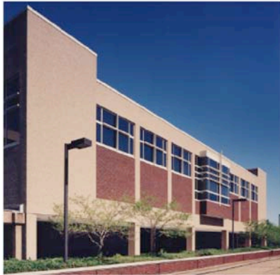
Technology Learning Center Cuyahoga Community College Cleveland, OH American School & University Design Award