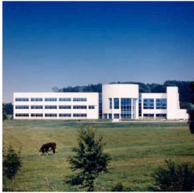
Wayne Dalton Headquarters Mt. Hope, OH AIA Ohio Design Award AIA Cleveland Design Award First Place, Build Ohio Competition