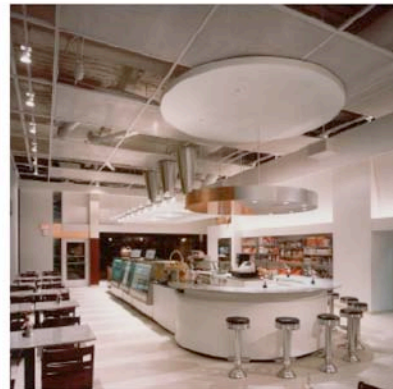
Cafe Paradiso Cleveland, OH IDB/ IIDA National Design Competition Winner AIA Ohio Design Award AIA Cleveland Design Award IIDA Cleveland Design Award NAIOP Regional Design Award