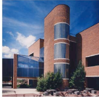
Student Service/ Learning Resource Center Terra Community College Fremont, OH